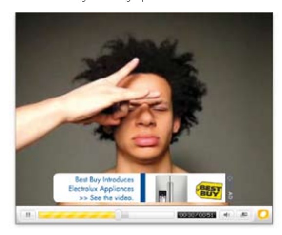
Video Egg offers in video advertising. The banner will show a video within the video.

of so-called "invitation ads" to guarantee the requested number of engagements in an advertiser's target demographic.