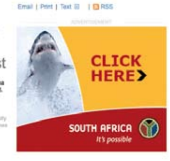
Contextual advertising can be humorous